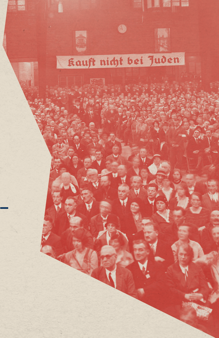
Pro-Nazi meeting or rally. A sign in the back reads "Kauft nicht bei Juden" (Don't Buy from Jews). Circa 1933-1934.

Despite these fears, some did take action. What strategies did ordinary Americans take to protest Nazi antisemitic policies?